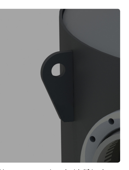
Skimmers are equipped with lifting lugs

* power consumption given for 230V model