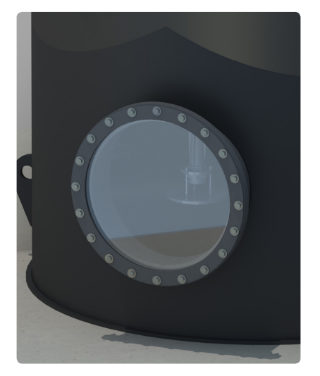
An inspection/acces window is installed