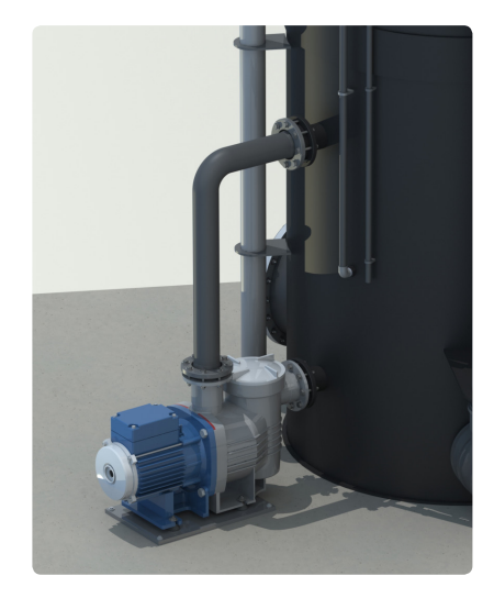
The pump is connected to the skimmer by flange joints

Your specialist in design and construction of Recirculating Aquaculture Systems (RAS)